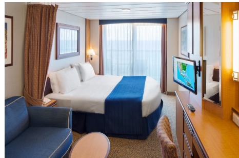
Photos show 1 bed. All rooms can be 2 beds also Oceanview Balcony: Call for rates and availability 561-702-2312

Deposit: Double Occupancy: $300. per person, Single Occupancy, $600.