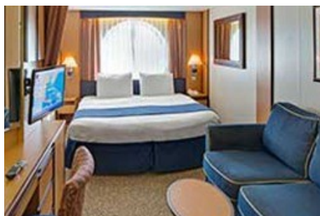
Oceanview Stateroom: 170 sq. ft. Call for rates and availability 561-702-2312